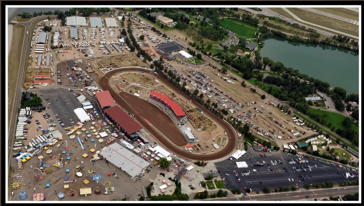
Overhead view of Frontier Park